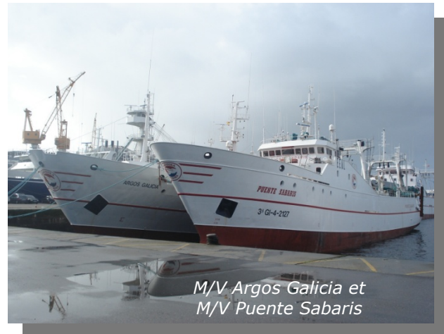
M/V Argos Galicia et M/V Puente Sabaris

In December 2007, an examination of the cylinder heads of the main engines and the auxiliary engines of the Argos Galicia revealed that the Xbee enzyme was beneficial in terms of both cleanliness and maintenance. The company decided to expand use to two further large vessels of the fleet, namely the Argos Vigo and the Puente Sabaris , with a plan for general use of Xbee throughout the whole fleet in 2008.